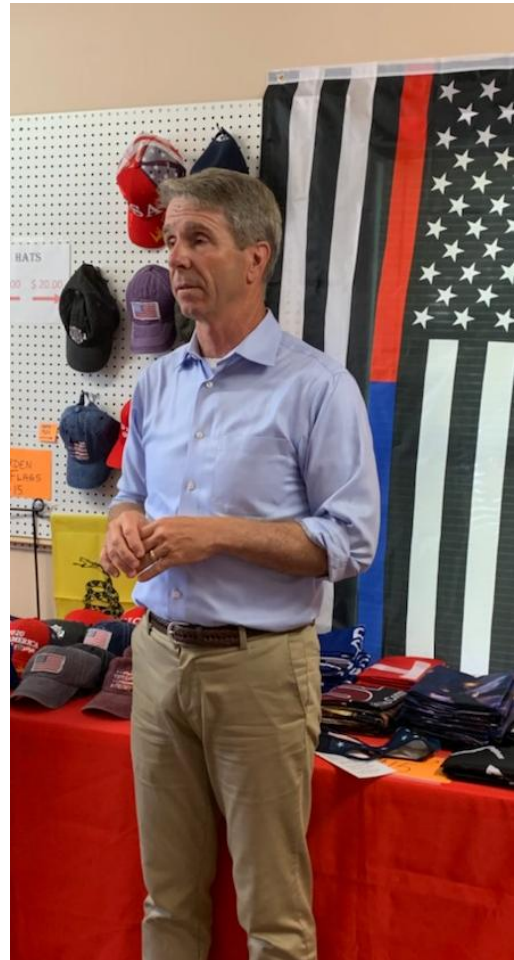
Congressman Rob Wittman

The photo, right, of Congressman Wittman was taken during an informal Meet & Greet at 1 st District GOP Headquarters in Gloucester, August 28. Rob showed great concern while answering questions from constituents. The above expression was in response to concerns expressed about the U.S. Postal Service. He assured his audience the USPS isn't looking for funding at this time, but wants to do whatever is necessary—including postponing planned equipment updates—to ensure 2020 Election ballots and the election process, itself, are not compromised due to inefficiencies of the postal department.